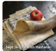
Sept 16-17 - Rosh Hashana