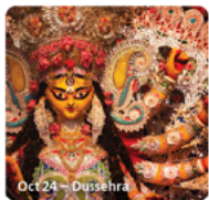
Oct 24 - Dussehra