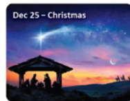
Dec 25 - Christmas