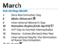
Mar 10 - Ramaçan