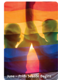
June - Pride Season Begins