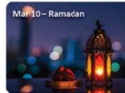
Mar 10 – Ramadan