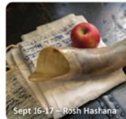
Sept 16-17 – Rosh Hashana