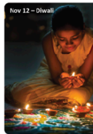
Nov 12 – Diwali