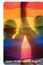
June – Pride Season Begins