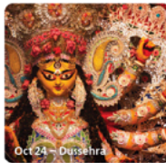
Oct 24 – Dussehra