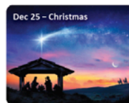
Dec 25 – Christmas